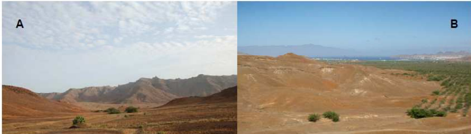
General view of the study area showing trees of Prosopis juliflora and Calotropis procera . A) North-South valley; B) East-West valley, S. Vincente