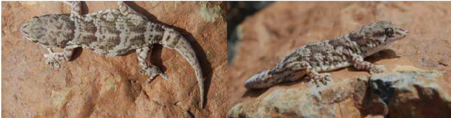
Dorsal and lateral view of the endemic gecko subspecies of S. Vincente Island, Tarentola caboverdiana substituta