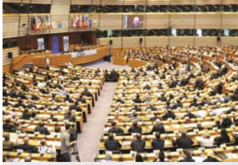
Hemicycle hall finally full

The EPE event was organized by EUROCHAM-BRES to stress the key role of European busi-