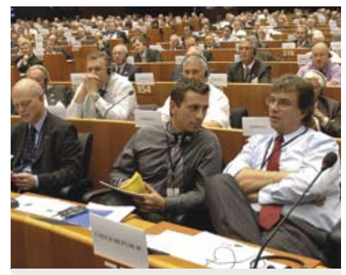
Czech business voting on the EU legislative proposals during the EPE event.

CEBRE held a Business Breakfast on greening transport in Europe in the Czech House. Representatives from EU institutions, the Ministry of Transport, the European Parliament, International Road Transport, and the business community discussed the Greening Transport Package as well as the "Eurovignette" directive and its potential impact