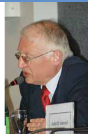
COMMISSIONER GÜNTER VERHEUGEN SPEAKING TO CZECH BUSINESSMEN AT THE CHAMBER PREMISES IN PRAGUE

“Higher productivity is also the only way for businesses in Europe to remain competitive, as new competitors join the global economy. Bringing about higher productivity, while also ensuring sufficient labour supply, will largely depend on the framework conditions set by legislators and regulators in Europe.”