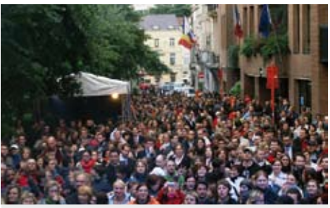
Czech Street Party in Brussels on June 26, 2009

Czech Street Party came on July to the city for a third time, bringing again the best of Czech rock music, Czech Beer, Moravian Wine, local specialties and more. The event closes the cultural program of the Czech EU. Party was organized by the Czech Permanent Representation to the EU.